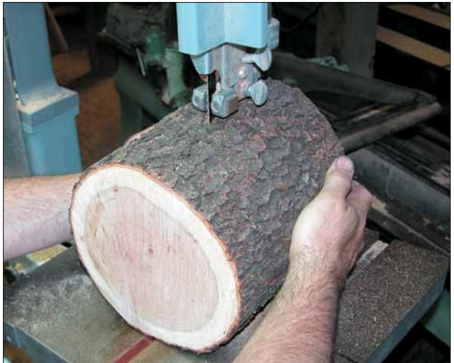
A recommended ripping procedure: The downward pressure of the bandsaw blade reduces the tendency of the log to roll side to side.