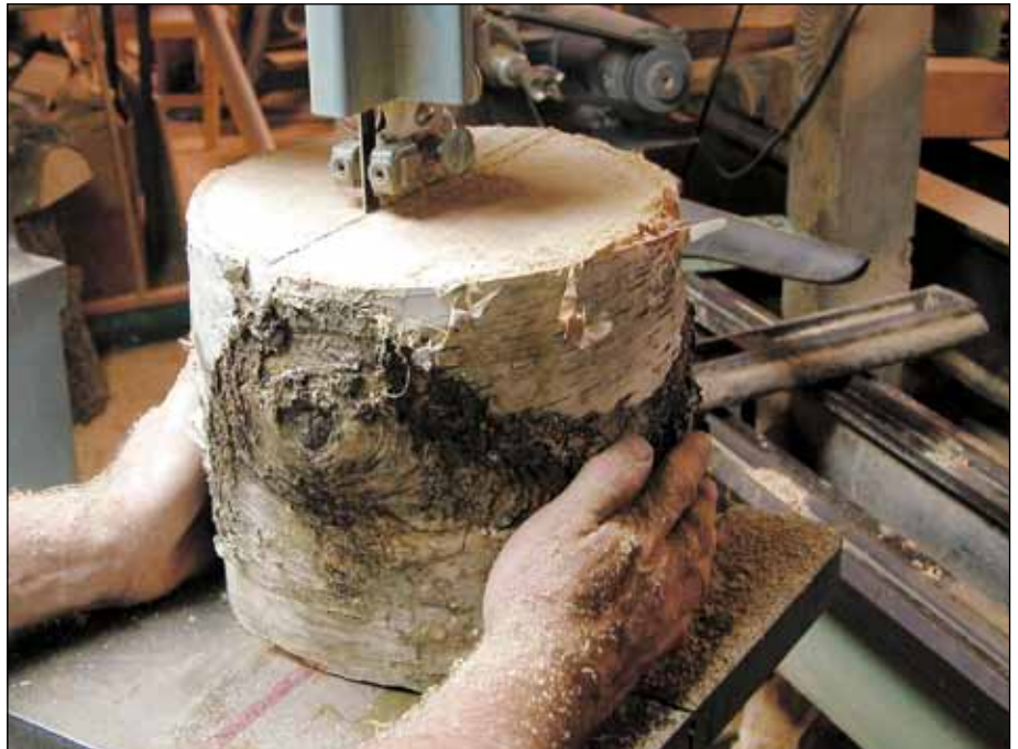
With 6"-diameter or larger stock, you can bandsaw logs upright to halve the material. Note safe hand position.

Another strategy is to cut head on to the end-grain as shown at right —truly a ripping cut. This cut on supported wood avoids the