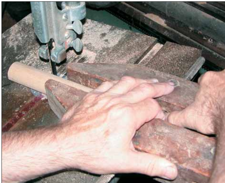
To crosscut short round stock, securing material in an adjustable parallel (handscrew) clamp is a solid solution.

For making multiple blanks 2" or smaller, crosscut stock with your bandsaw miter gauge. Clamp smaller pieces of wood against the miter-gauge fence and cut away—a good technique to